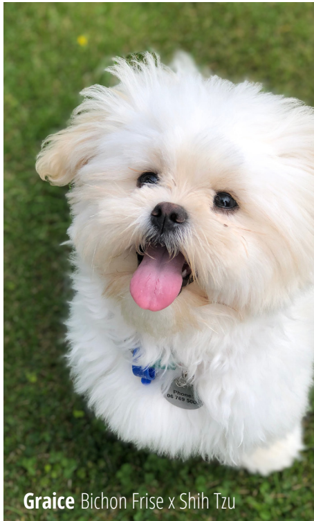
Graice Bichon Frise x Shih Tzu

Donations of $5 or more are tax deductible. Receipts can be sent upon request.